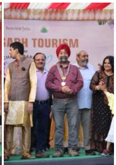
Glimpses of the event